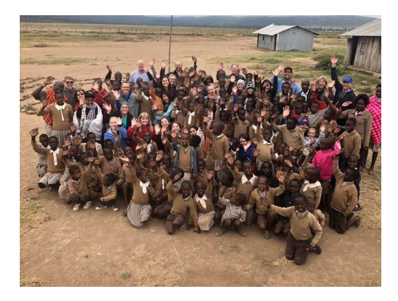
You can be a part of the GO-ing by supporting our summer missions teams by going to bethanylb.org/trips.

"But you will receive power when the Holy Spirit has come upon you; and you shall be My witnesses both in Jerusalem, and in all Judea and Samaria, and even to the remotest part of the earth." Acts 1:8