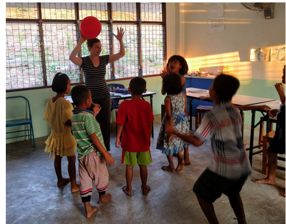
The kids have so much fun playing games to practice their English!