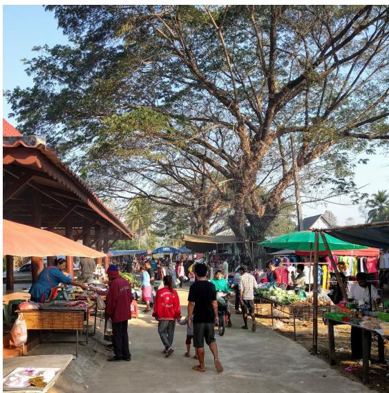
Huay Malai market