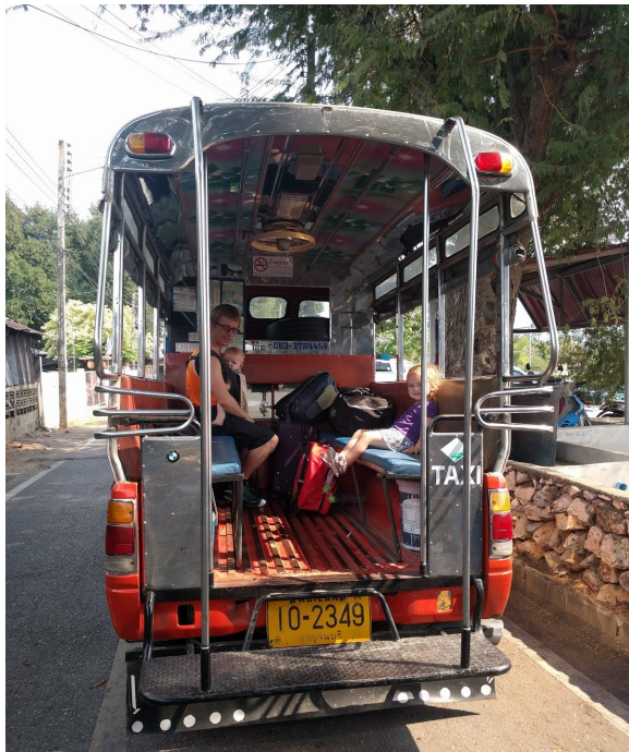
We have taken a lot of different kinds of transportation in Thailand! Here we are in a truck-taxi called a Songthaew on our way to Kanchanaburi