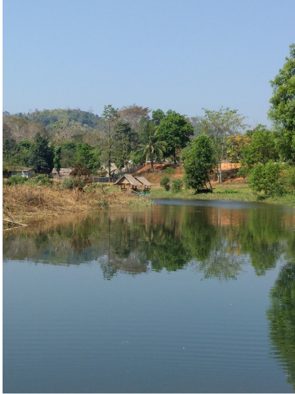
Neighboring village Bon Mai