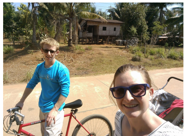
During our down-time, we have been able to borrow bicycles to see the village and surrounding area. Above, you will see a common home made of bamboo. Many of the houses are raised on bamboo stilts like this one to avoid flooding during rainy season, and to keep wildlife out.